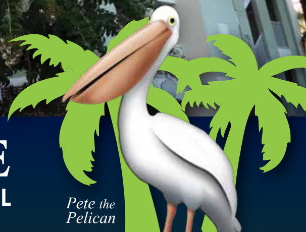
Pete the Pelican